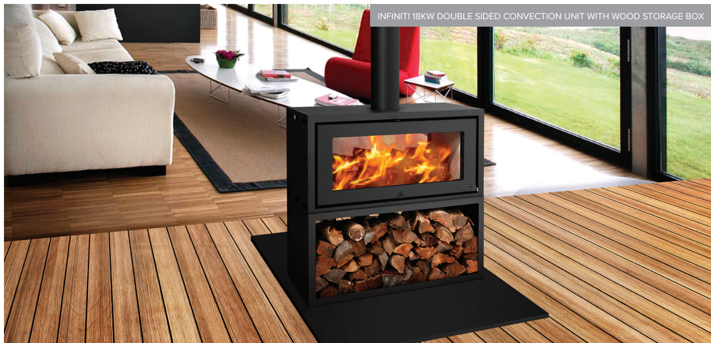
INFINITI 18KW DOUBLE SIDED CONVECTION UNIT WITH WOOD STORAGE BOX

Our double sided freestanding units are great for positioning near the middle of a large open plan area, to provide heat and the visual appeal of the flames to both sides. Both doors can easily open, enabling the fire to be fed from either side and the glass to be easily cleaned when necessary.