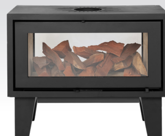
INFINITI 18 KW DOUBLE SIDED UNIT ON TAPERED LEGS

Our 18 Kw double sided stoves come in a choice of a Clear Glass at the rear of the door or a Black Border Glass located at the front of the door, for a more sophisticated look.