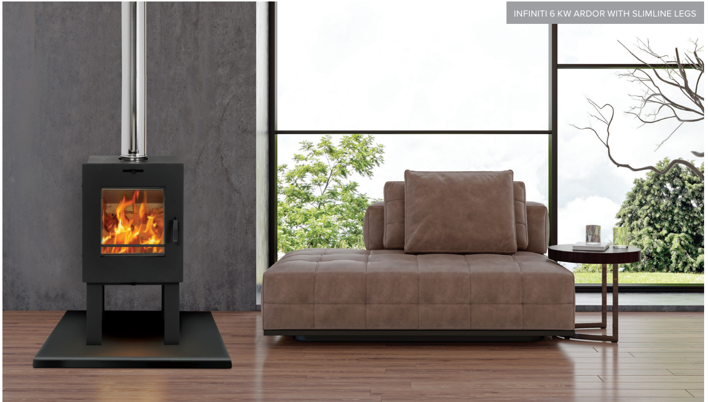
INFINITI 6 KW ARDOR WITH SLIMLINE LEGS