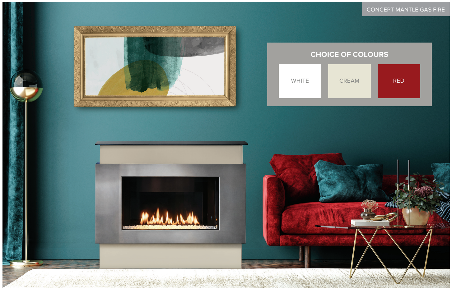
CONCEPT MANTLE GAS FIRE